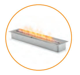
MODEL: XL900 LOCATION: Criniti's Restaurant, Australia www.crinitis.com.au

The XL burners in both restaurants are prominently located in expansive custom-made stone and timber benches which delineate the open kitchens, preparation and serving areas. The elongated flames sit behind a bespoke swirling steel grille, with the Criniti's logo clearly embossed above the eye-catching centrepiece.