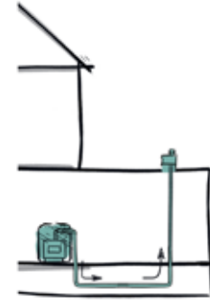
Via crawl space